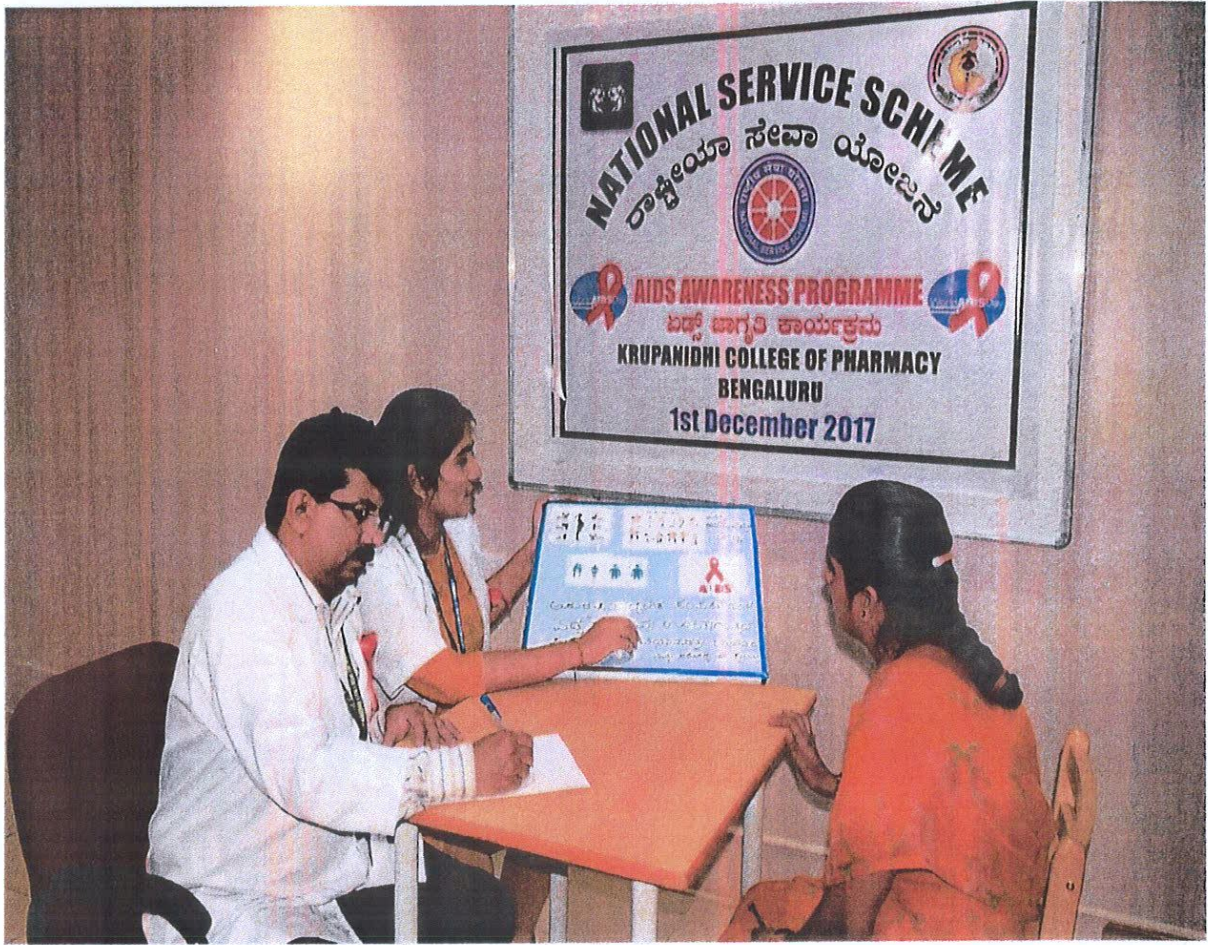
AIDS AWARENESS PROGRAMME ON WORLD AIDS DAY