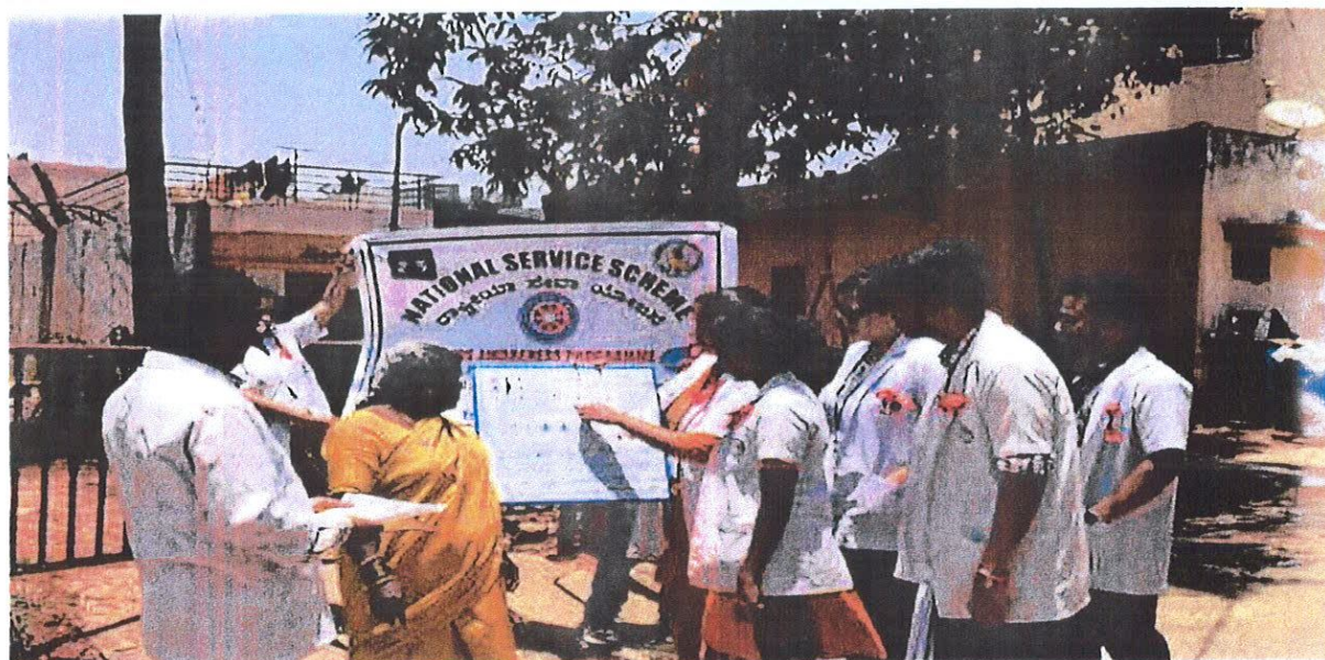
GLIMPSES OF AIDS AWARENESS PROGRAMME

The door-to-door campaign was also very productive as we get some insight into the level of understanding about AIDS the need to have preventive measures. Volunteers distributed patients' information leaflets and made the villagers aware about every aspect of AIDS.